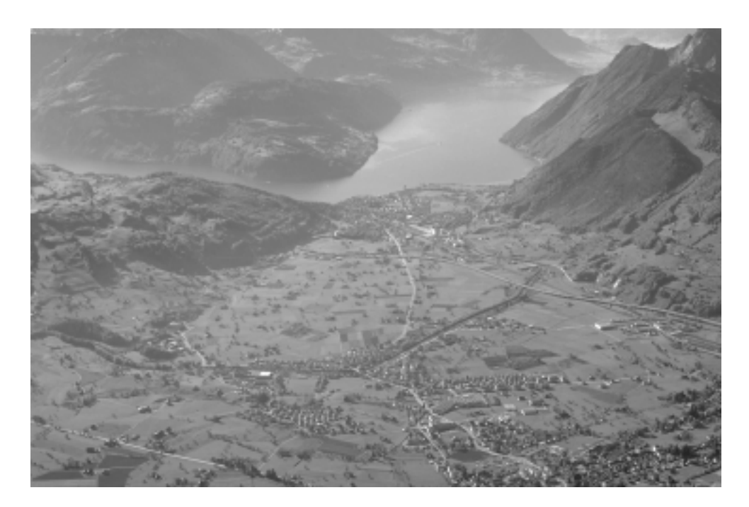
Figure 1: View from the Großer Mythen (real landscape).