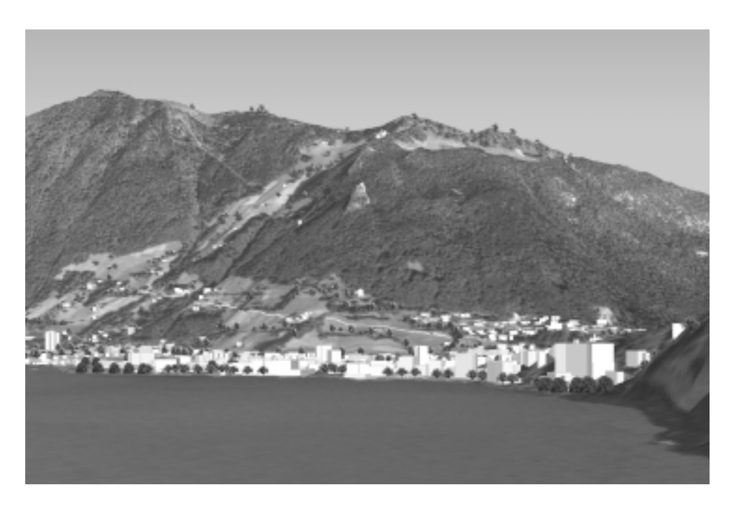
Figure 3: View towards Brunnen (virtual landscape).

Table 5: Evaluation of the view from the Großer Mythen (virtual landscape).