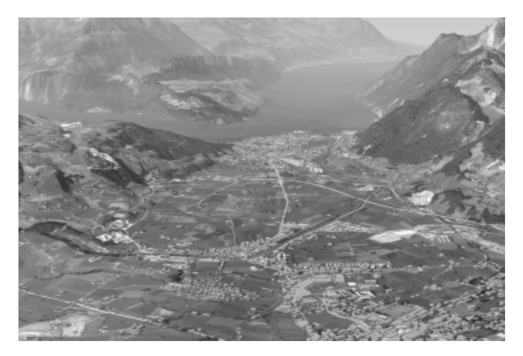
Figure 2: View from the Großer Mythen (virtual landscape).

Table 4: Evaluation of the view from the Großer Mythen (real landscape).