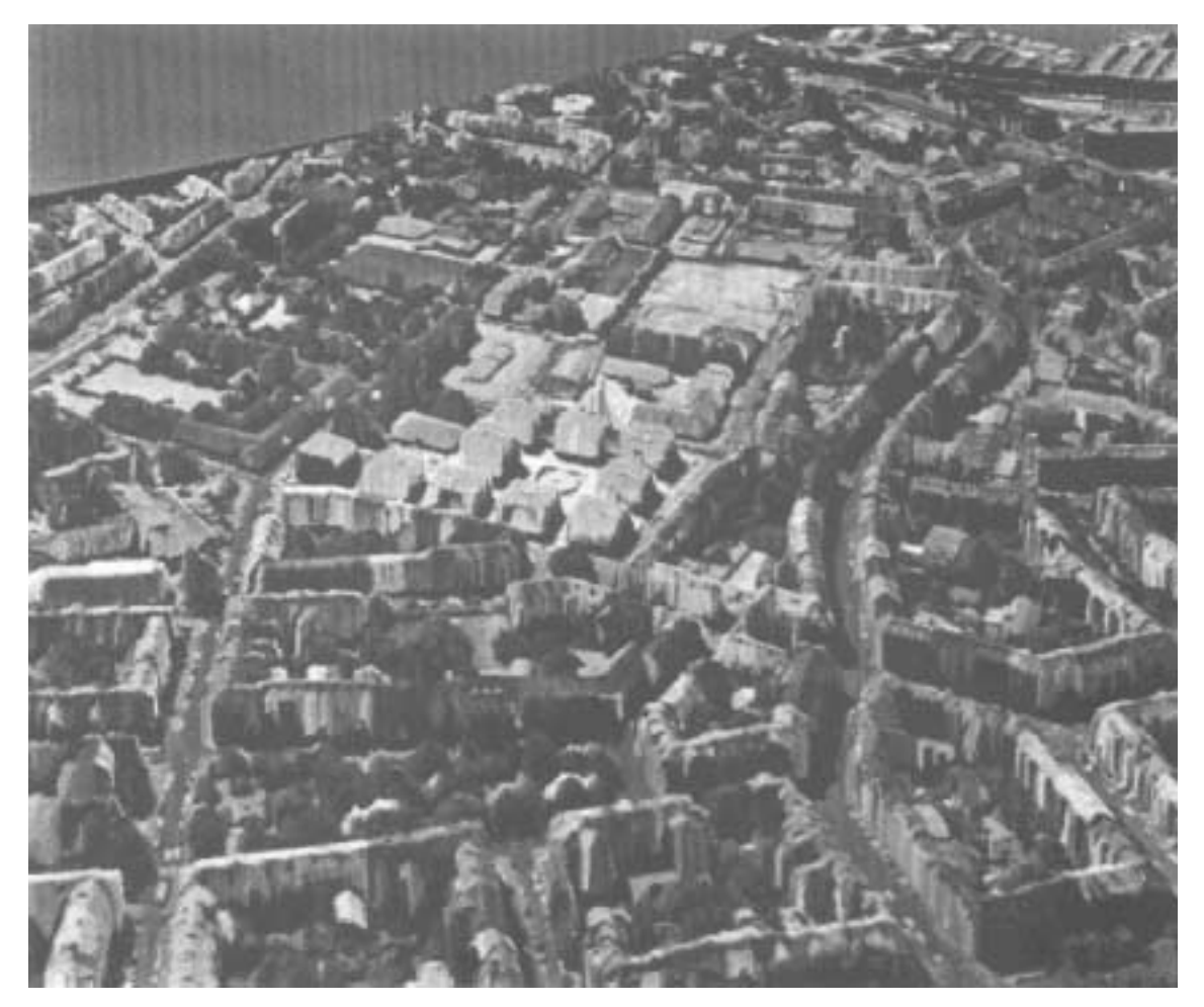
Figure 3: Section of the TopoSys DEM of Hannover city.