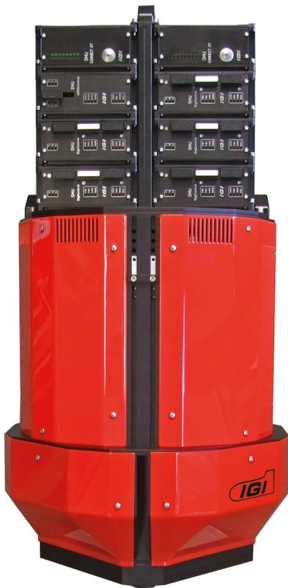
Figure 2: IGI Quattro-DigiCAM-Oblique & IGI Penta-DigiCAM .

The IGI Quattro-DigiCAM-Oblique is another housing for the Quattro-DigiCAM-300 system which offers the opportunity to use one aerial camera system for two purposes: the collection of nadir & oblique imagery.