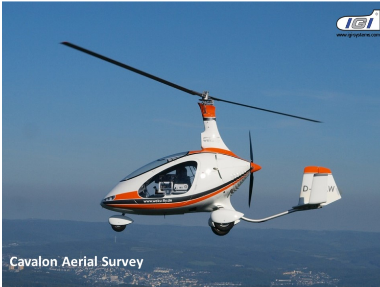
Figure 6: IGI CAVALON Aerial Survey during a survey flight (camera & laser).

At INTERGEO 2012 IGI introduced a gyrocopter for aerial surveys. Gyrocopters have been invented in the year 1923. Due to their design, they are particularly good for aerial surveys and there are easier regulations than with RPAS/UAVs. A gyrocopter can carry standard survey equipment and with the use of a CCNS-5 even untrained pilots can carry out aerial survey missions in a short time.