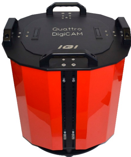
Figure 1: IGI Quattro-DigiCAM .