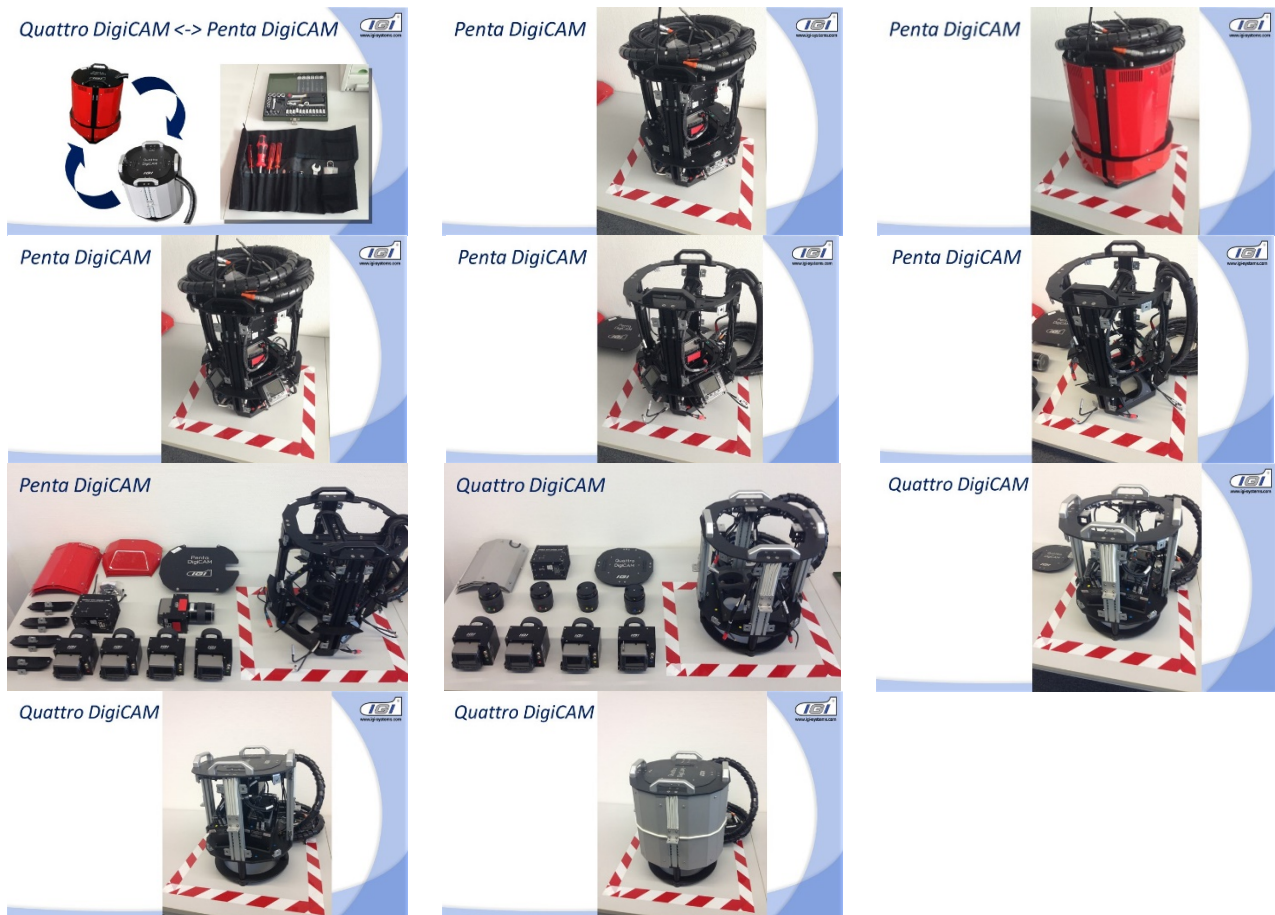
Figure 3: Conversion of an IGI Penta-DigiCAM to an IGI Quattro-DigiCAM .

Using up to five DigiCAM camera systems a Quattro-DigiCAM camera system can be converted into a Penta-DigiCAM camera. Figure 3 shows the conversion process which can be done by the operator himself within 2-3 hours. This smart solution gives the opportunity to use one camera system as large format and nadir + oblique aerial camera system.