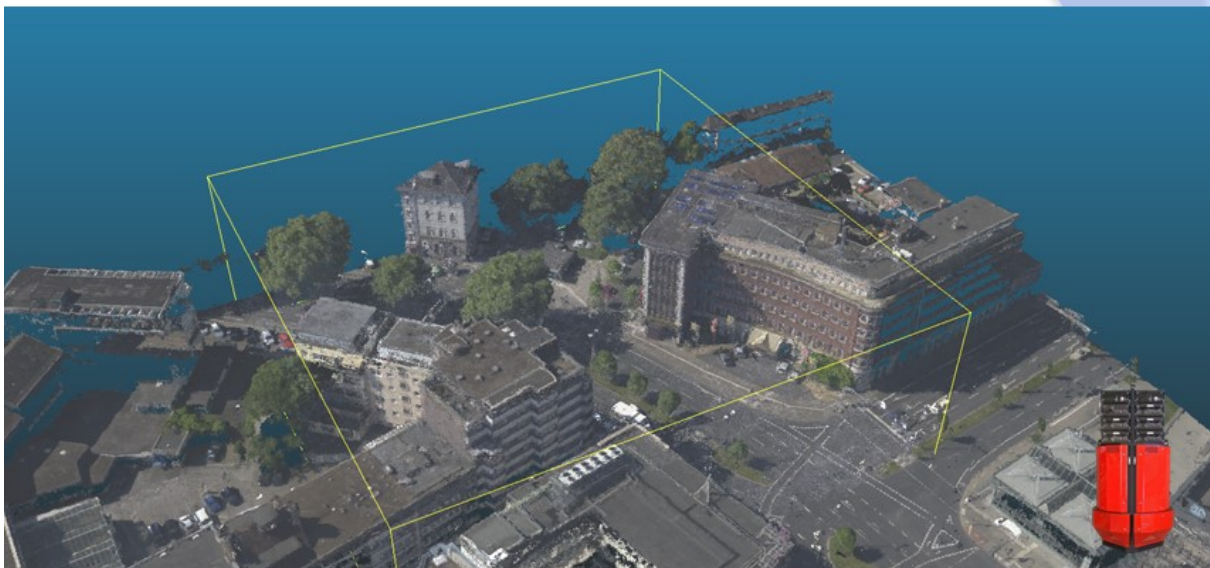
Figure 5: IGImatch 3D Nadir & Oblique View.

For Figure 4 only nadir imagery was processed and house façades have information lacks, using nadir & oblique imagery the house façades are clear and clean.