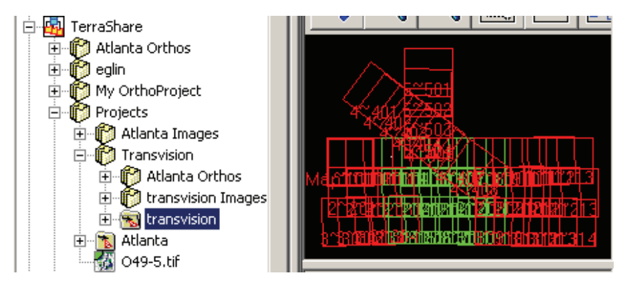
Figure 2 - TerraShare Project