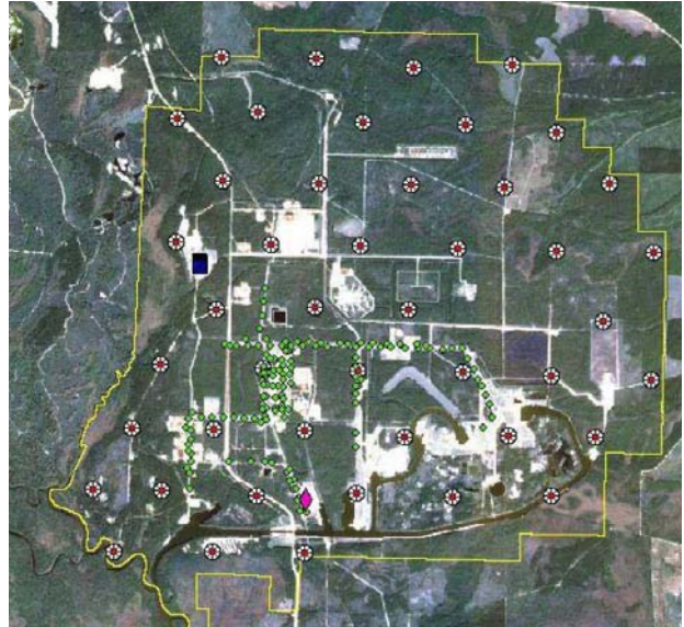
Figure 2: The NASA Stennis Space Centre test site.

Since several decades the (North-American) mapping community relies on the USGS, providing necessary (analogue) camera calibrations to ensure quality of final products. In the upcoming digital world similar standards and certifications are also expected for the digital sensors and products. This motivates the USGS activities in assessment of existing calibration standards and new digital camera/sensor technologies. The general strategy could be given like follows: define a certification setup first, confirm the topics to be checked and validated and finally prepare methods for quality assessment and quality control. Such topics were deeply discussed during the special session "Digital sensor calibration: research, policies and standards" organized by USGS at this years ASPRS spring meeting in Baltimore (ASPRS, 2005).