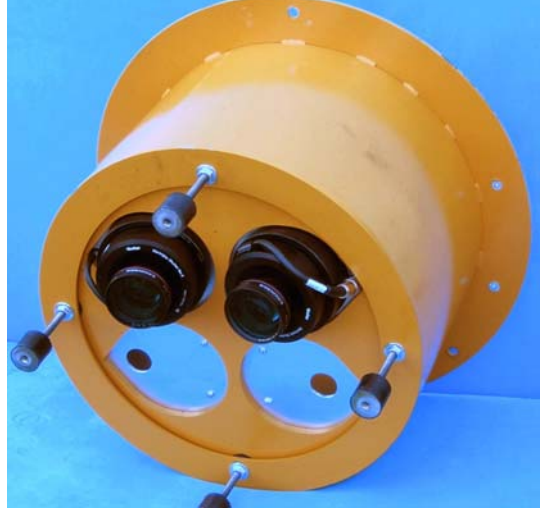
DIMAC (© Dimac Systems 2003)