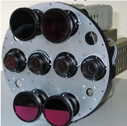
Ultracam D